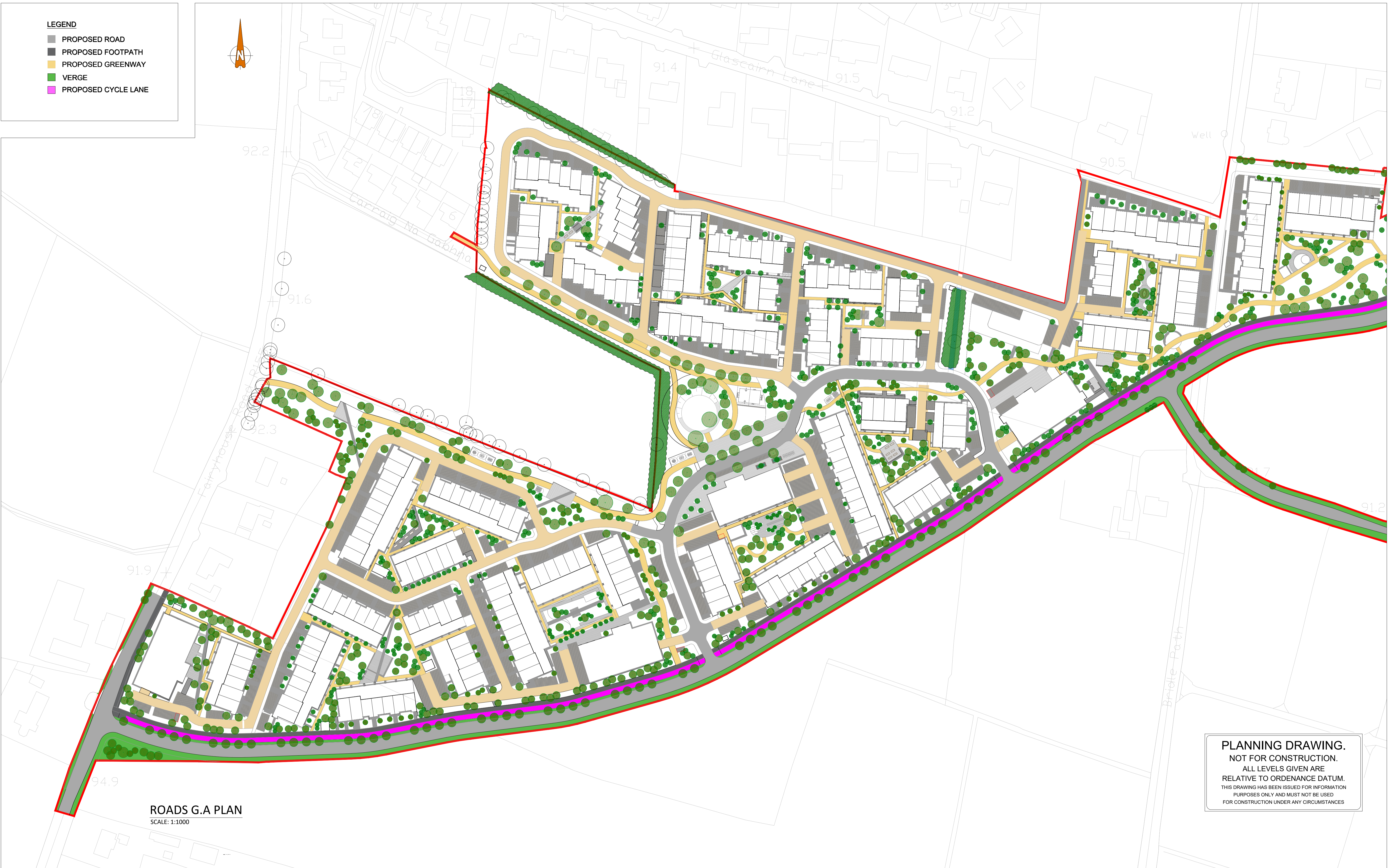
ROADS G.A PLAN SCALE: 1:1000

PLANNING DRAWING. NOT FOR CONSTRUCTION. ALL LEVELS GIVEN ARE RELATIVE TO ORDENANCE DATUM. THIS DRAWING HAS BEEN ISSUED FOR INFORMATION PURPOSES ONLY AND MUST NOT BE USED FOR CONSTRUCTION UNDER ANY CIRCUMSTANCES